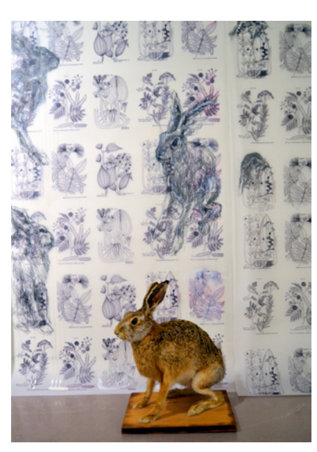
Installation detail

Taxidermied rabbits, quail, groundhog, great horned owl, tundra swan, courtesy of Zoological Specimen Collections, Department of Biology, Western University