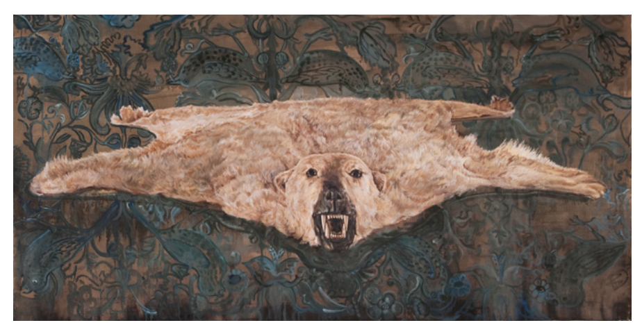
Isbjørn (with Strawberry Thief) 2011 Oil on linen, 137.0 x 290.0 cm