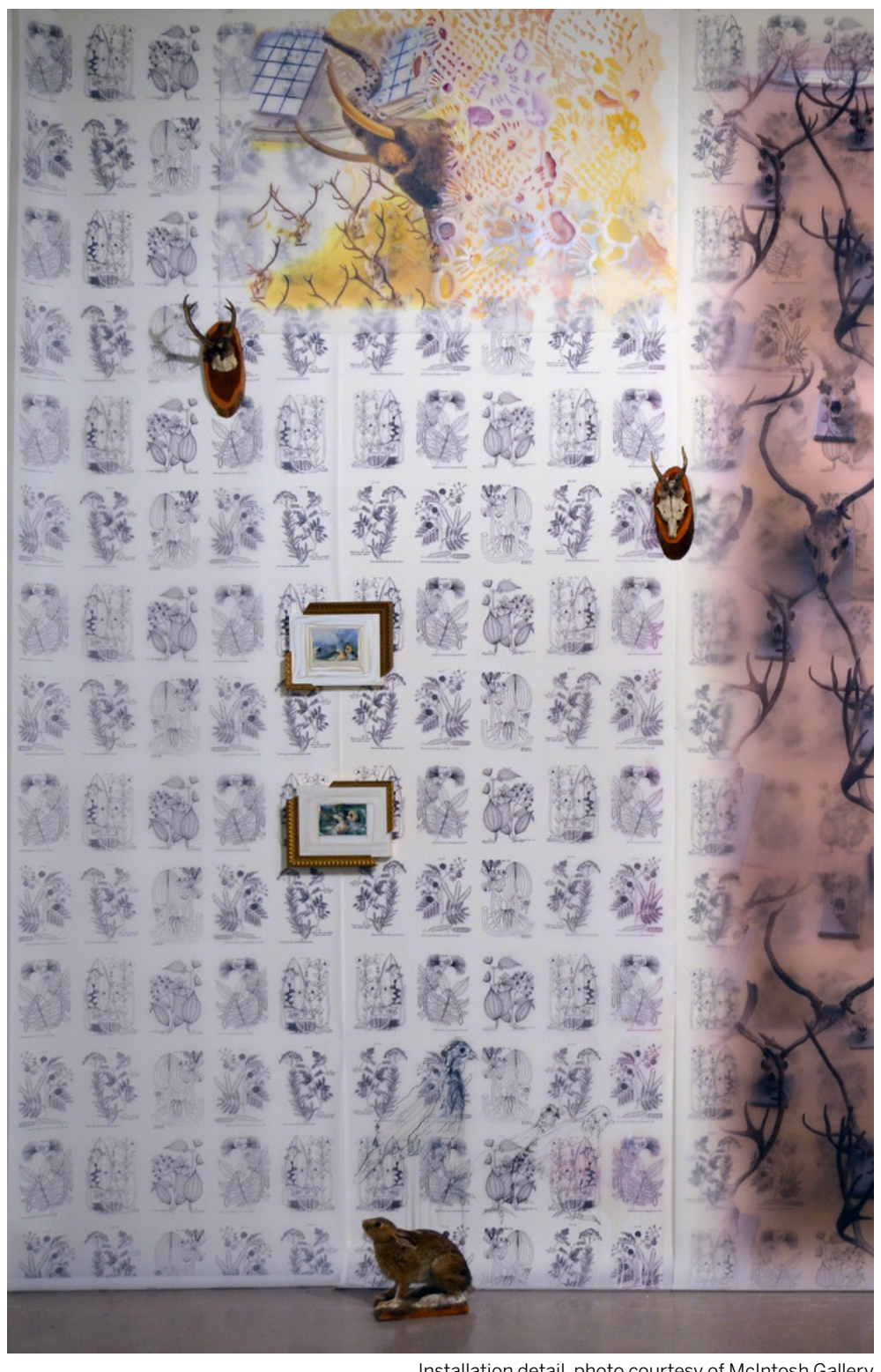
Installation detail