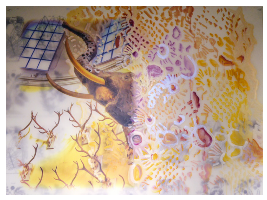
and one Elephant 2011 Oil over inkjet photograph on mylar 61.0 x 91.4 cm, photo courtesy of McIntosh Gallery.

To contemporary eyes steeped in environmental issues and modern exhibition techniques, outmoded taxidermy is horrific. To the nineteenth century museum visitor, however, these displays were a rich storehouse of knowledge awaiting an inquiring mind able to discern subtle nuances between the juxtaposed specimens. Born in the eighteenth century's "cabinets of curiosity", the natural history museum soon evolved during the Age of Enlightenment's devotion to scientific research and education. Although considered a public institution, it was nonetheless only accessible to the upper classes, the only stratum considered sufficiently civilised to comprehend its treasures.