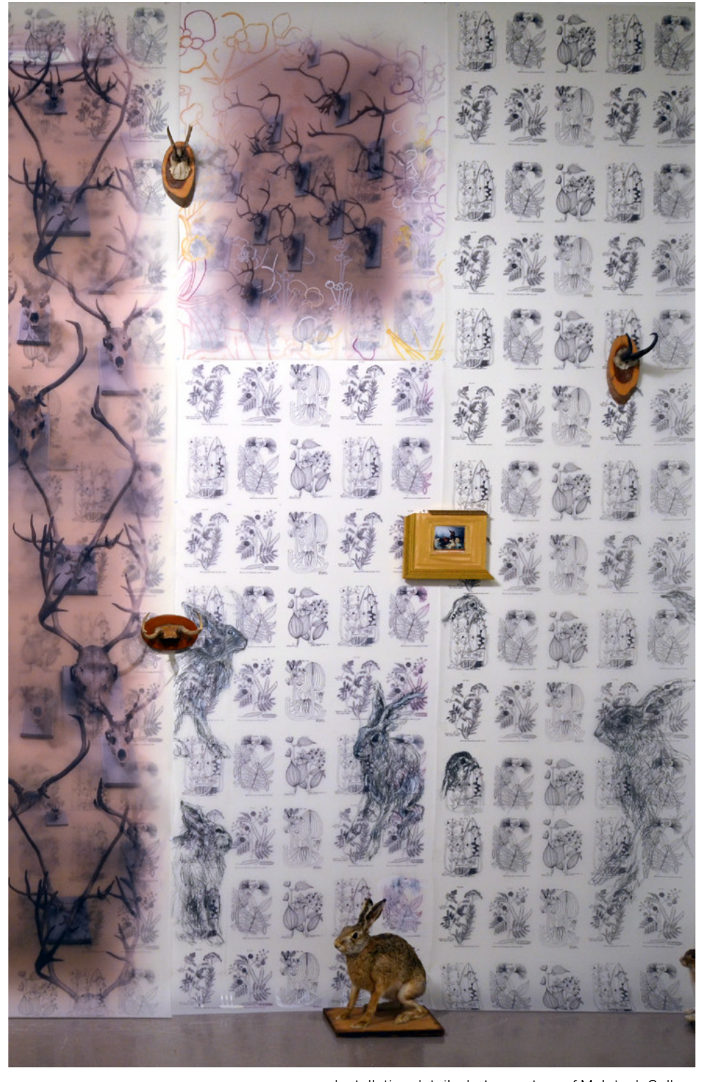
Installation detail