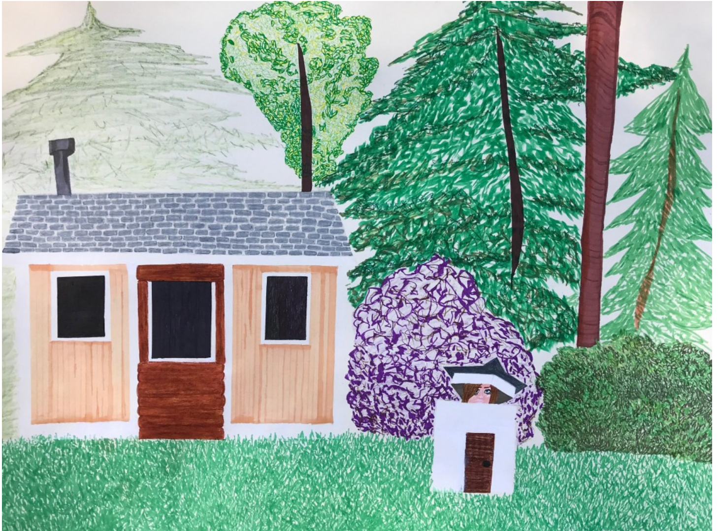
Shannon King Staying Indoors: Portable Agoraphobe Sharpie and marker on paper 2020