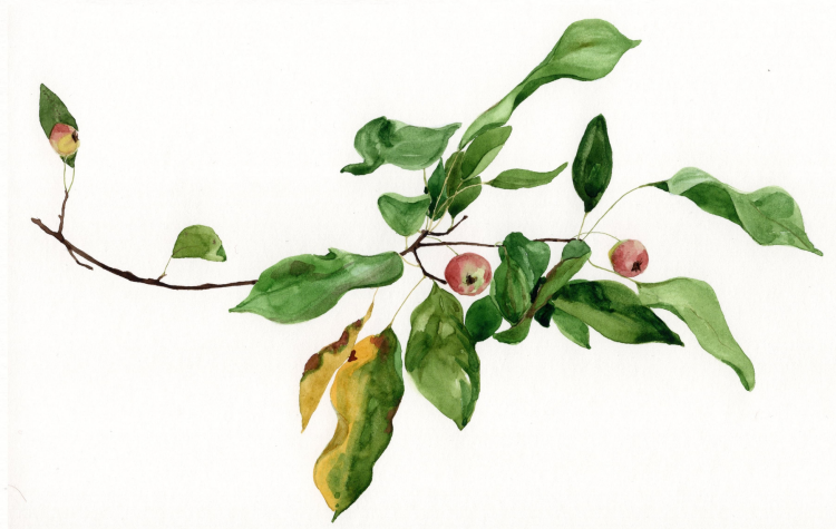
Niloufar Salimi 75 Oriole Rd, August 10, 2021 Watercolour on paper 2021 9 x 12 inches